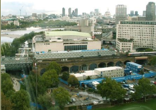
Hungerford Car Park: purchased by LCC for gardens in 1930's... car park since 1951

The final adoption can be legally challenged until mid-March. In April a more detailed document will be published including policies for major sites.